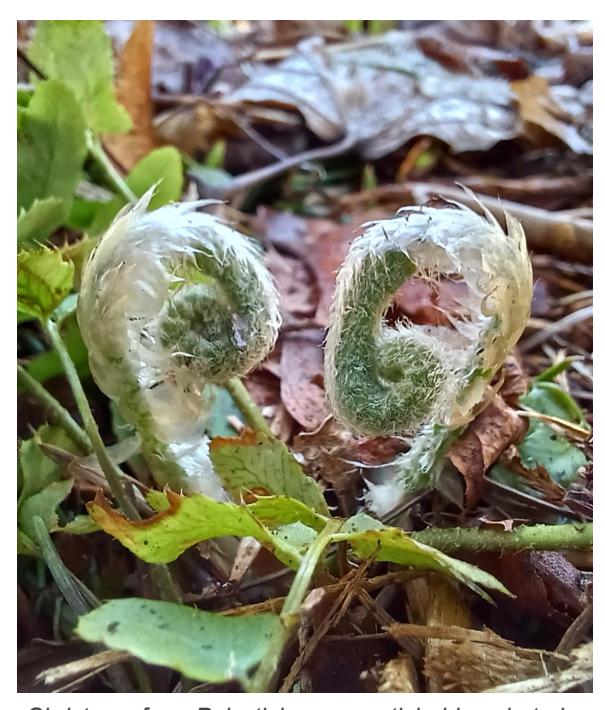
Christmas fern, Polystichum acrostichoides