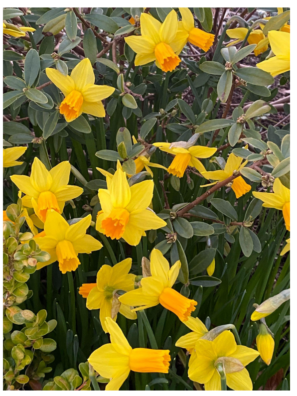
Narcissus 'Jet Fire'