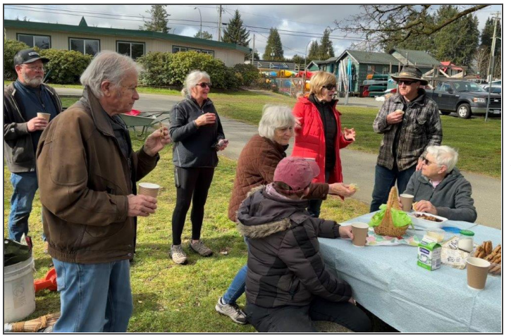
Volunteers snacking

Thank you to all 14 volunteers who participated in our first work party of the season on March 14th. What a great turnout!