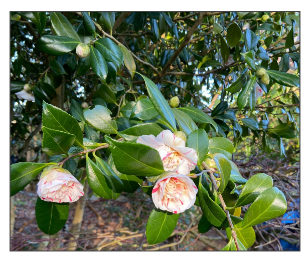
R. coeloneuron