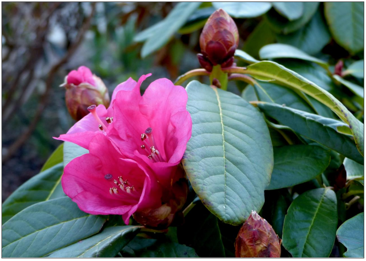
R. calophytum x repens (above) R. calophytum (right)